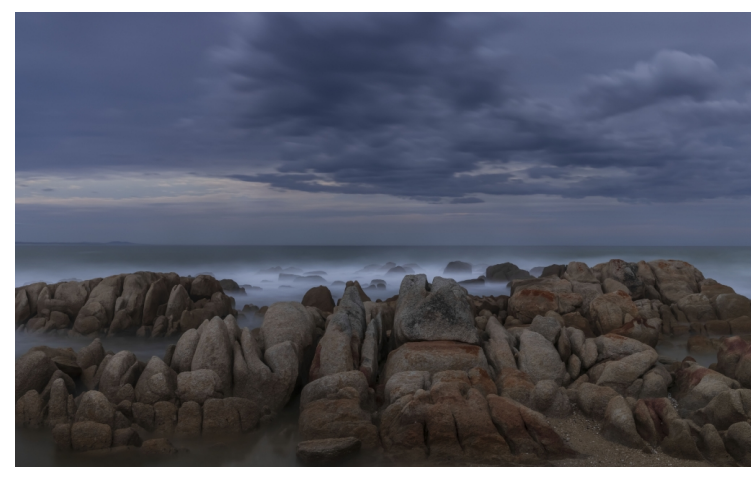
Hey Blue Merit Jo Fox