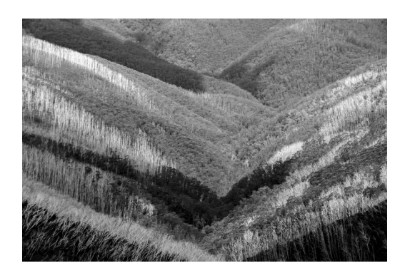
Dead trees Mt Hotham Accepted Veronica Curtis