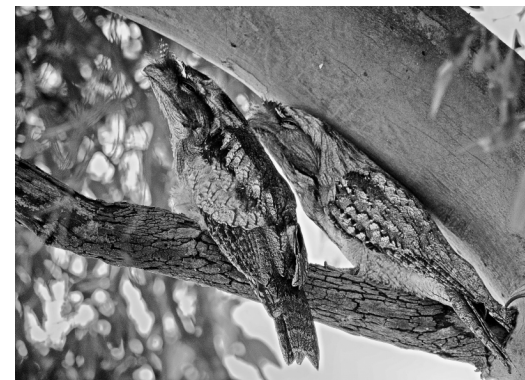
Tawnys Accepted Maureen Flexeder