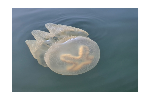
Jelly Fish Accepted Veronica Curtis