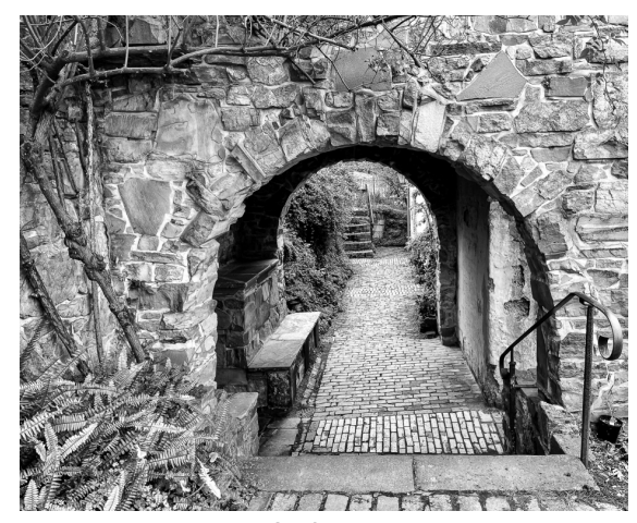
Archway Merit Noelene Barnes