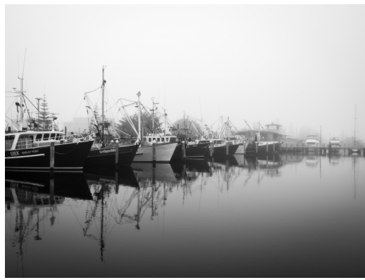
Foggy morning Accepted Julia Olle