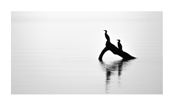
Morning Calm Accepted Sue Allison