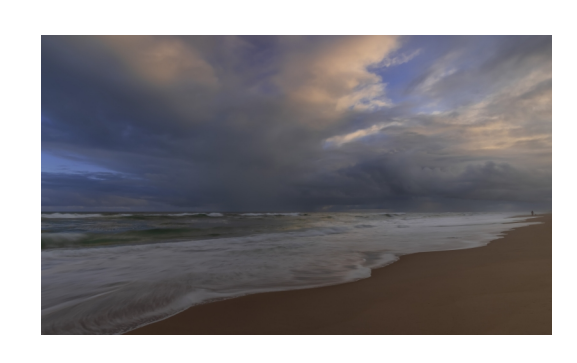
Insignificance Accepted Jo Fox