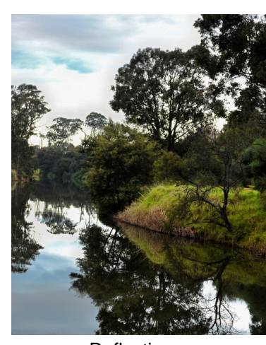
Reflections. Accepted Maureen Flexeder