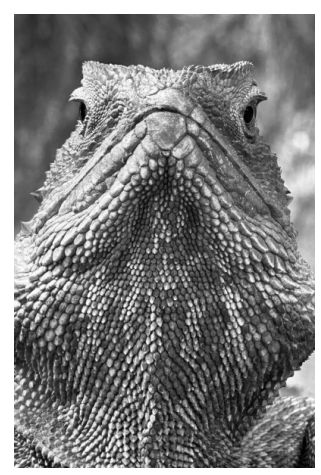
Black & White Accepted Mimi Chai