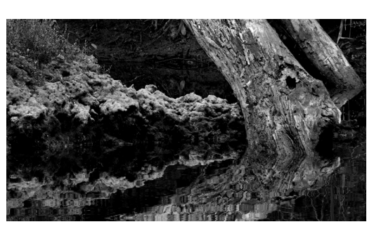
B&W reflection Accepted Sylvia Melsen