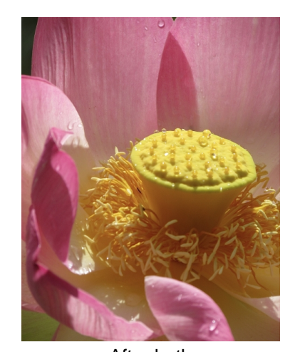
After bath Accepted Mimi Chai