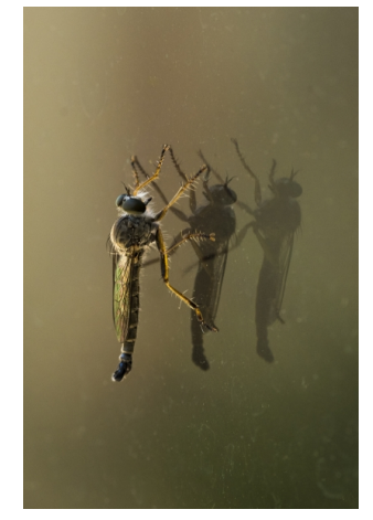
Robber Fly Reflected on Dirty Glass Accepted