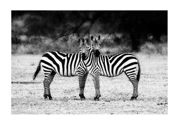
Confusion Accepted Keryn Gannon