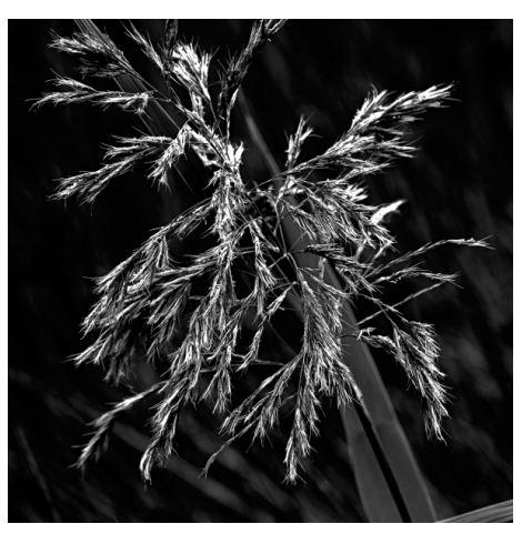
Flowering Grass Accepted Margaret Schutte