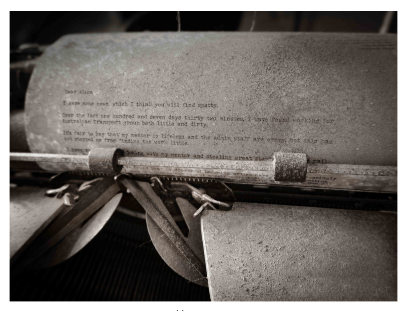
Never sent First Angela Stringer