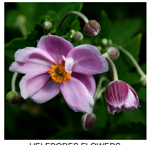
HELEBORES FLOWERS Accepted Veronica Curtis