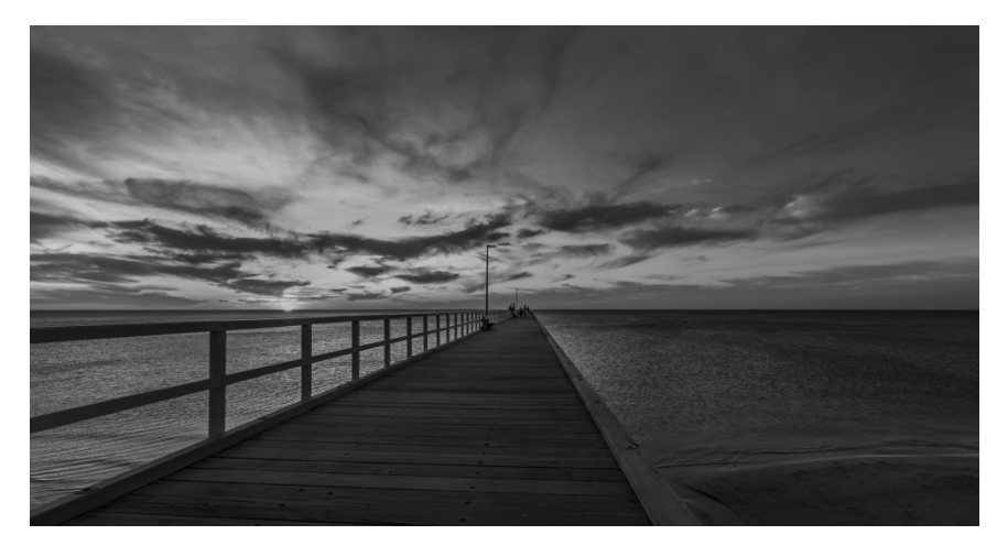
Cloud Kinetics Merit Jo Fox