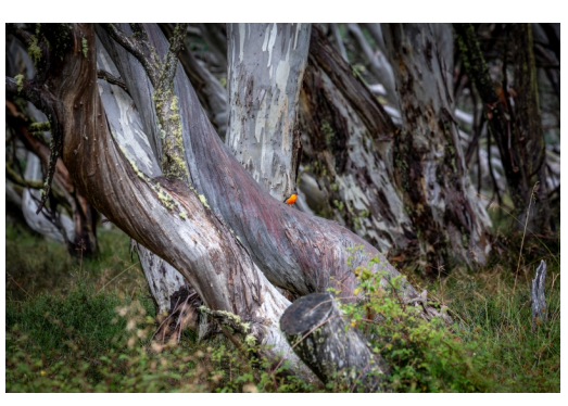
Colour in the High Country Accepted Angela Stringer