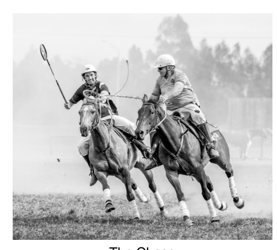
The Chase Accepted Sue Allison