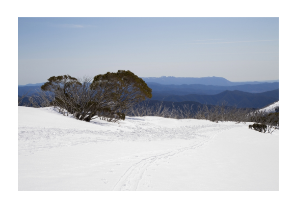
Mount Hotham Views Accepted Kelly Asmus Albornoz