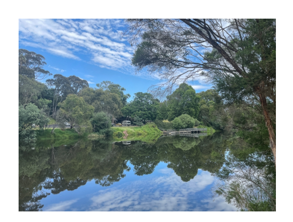
Port of Bairnsdale Accepted Noelene Barnes