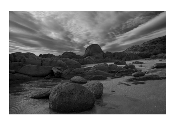
The Sad Turtle Accepted Jo Fox