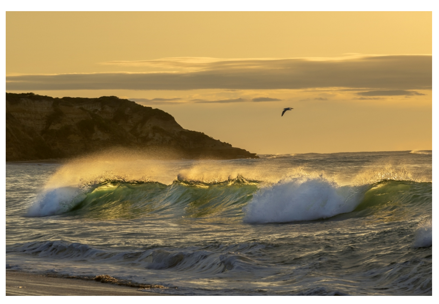
Waves on Lake Tyers Beach First Debbie Blennerhassett