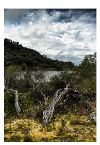
Lake Bunga Accepted Maureen Flexeder