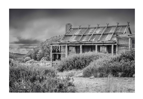
Surveying the valley Accepted Angela Stringer