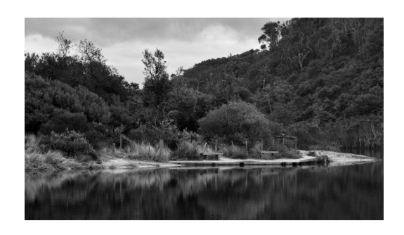
Lake Bunga in B&W Accepted Sylvia Melsen