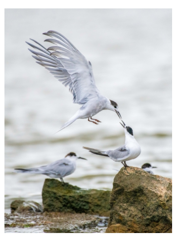
The Terns Accepted Sue Allison