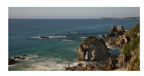
Stopping for a drink Accepted Janet Hopgood