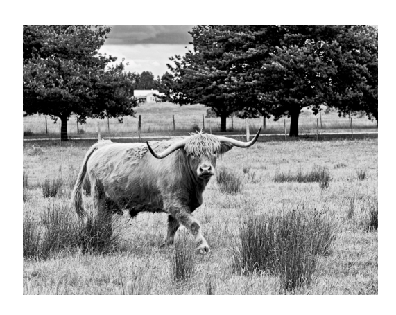
Highland Cattle Accepted Maureen Flexeder